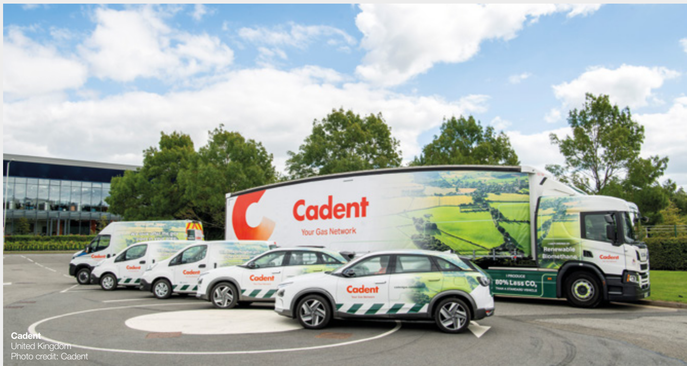
Cadent United Kingdom

Natural gas is one of the mainstays of global energy. Where it replaces more polluting fuels, it improves air quality and limits emissions of carbon dioxide. Since 2010, coal-to-gas switching has saved around 500 million tonnes of CO 2 . Natural gas is also a potential complement to renewable energy in that it can provide cover for the intermittency of power generated by renewables when the wind isn't blowing or the sun isn't shining.