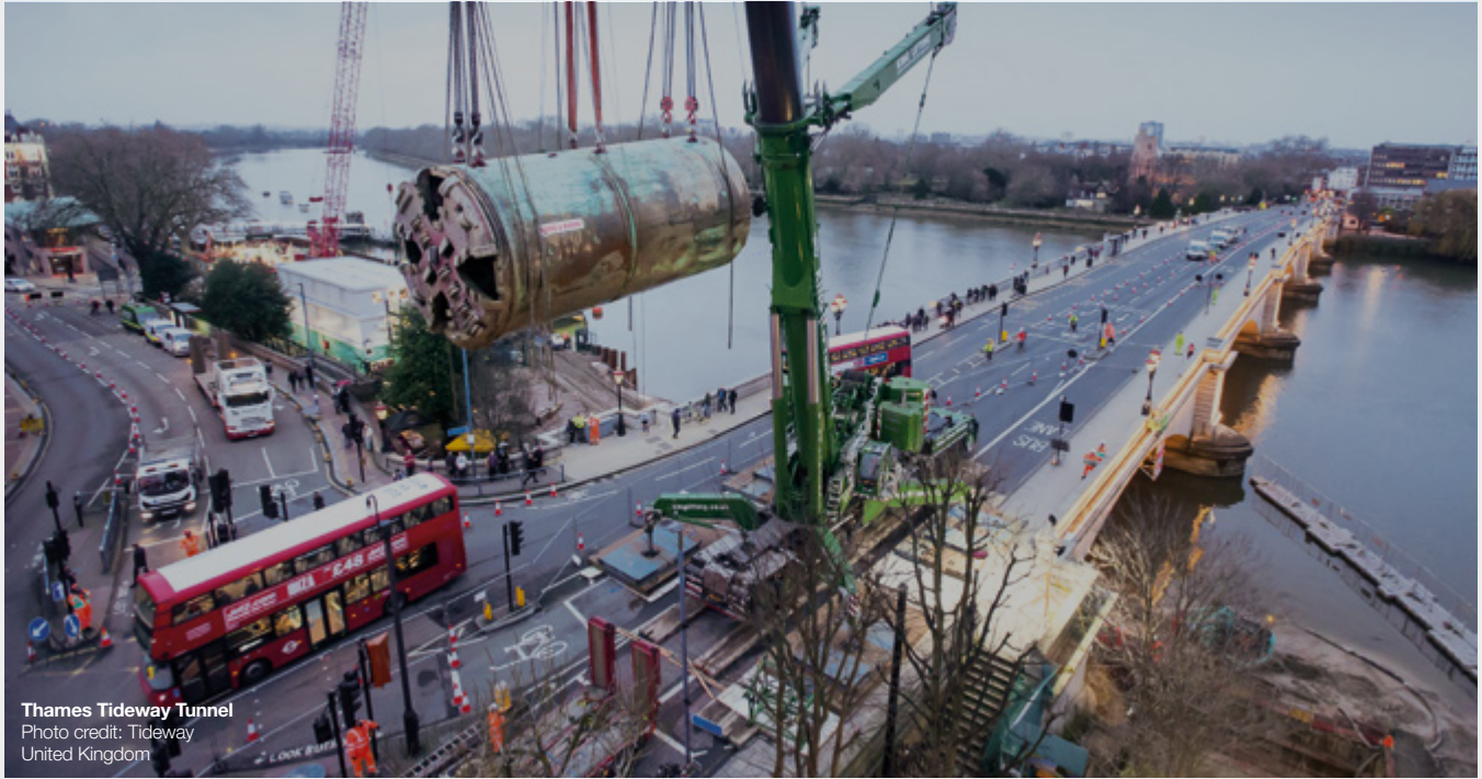
Thames Tideway Tunnel

Environmental infrastructure provides cities and towns with water supply, waste disposal, and pollution control services. These municipal works serve two important purposes: they protect human health and safeguard environmental quality.