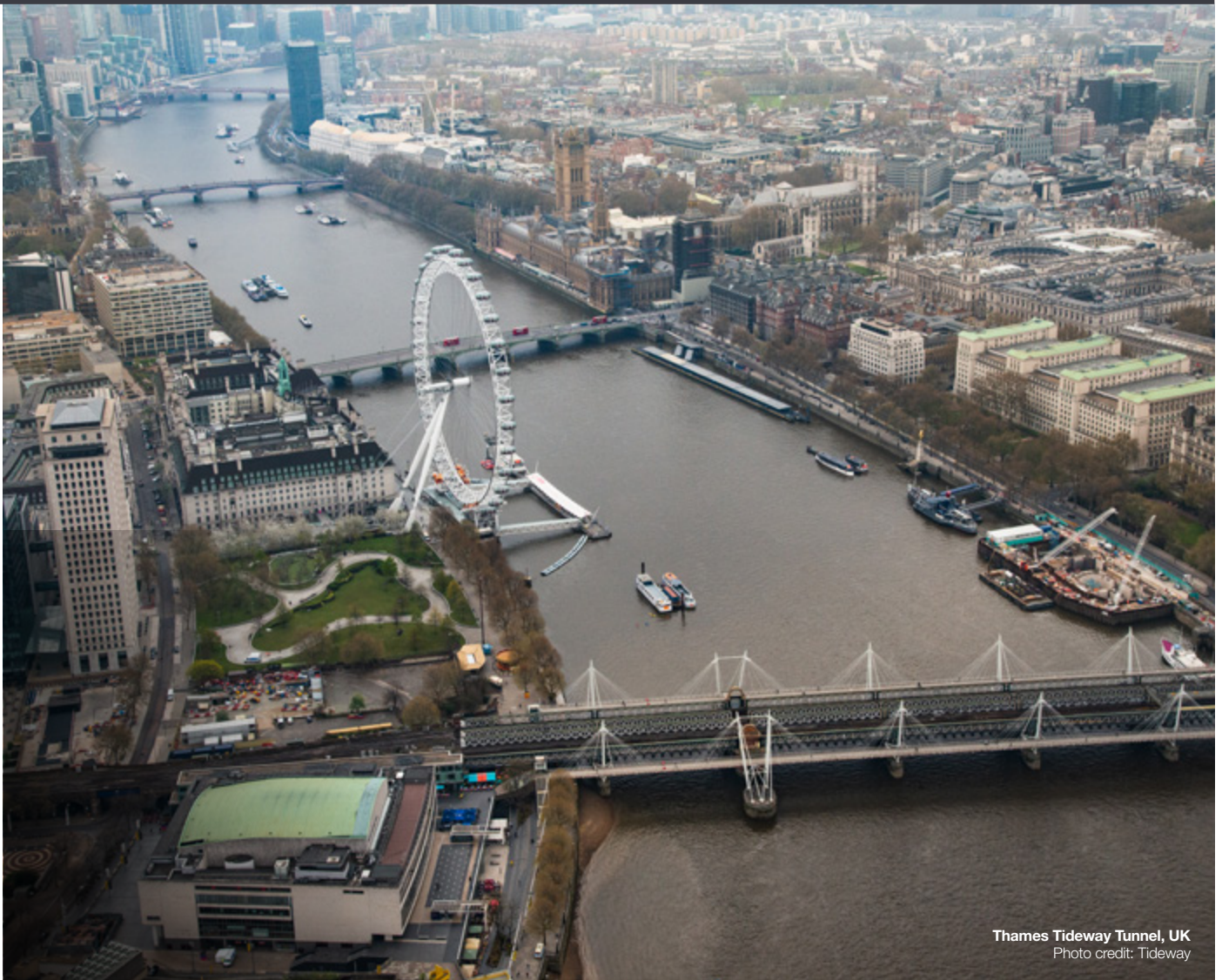
Thames Tideway Tunnel, UK