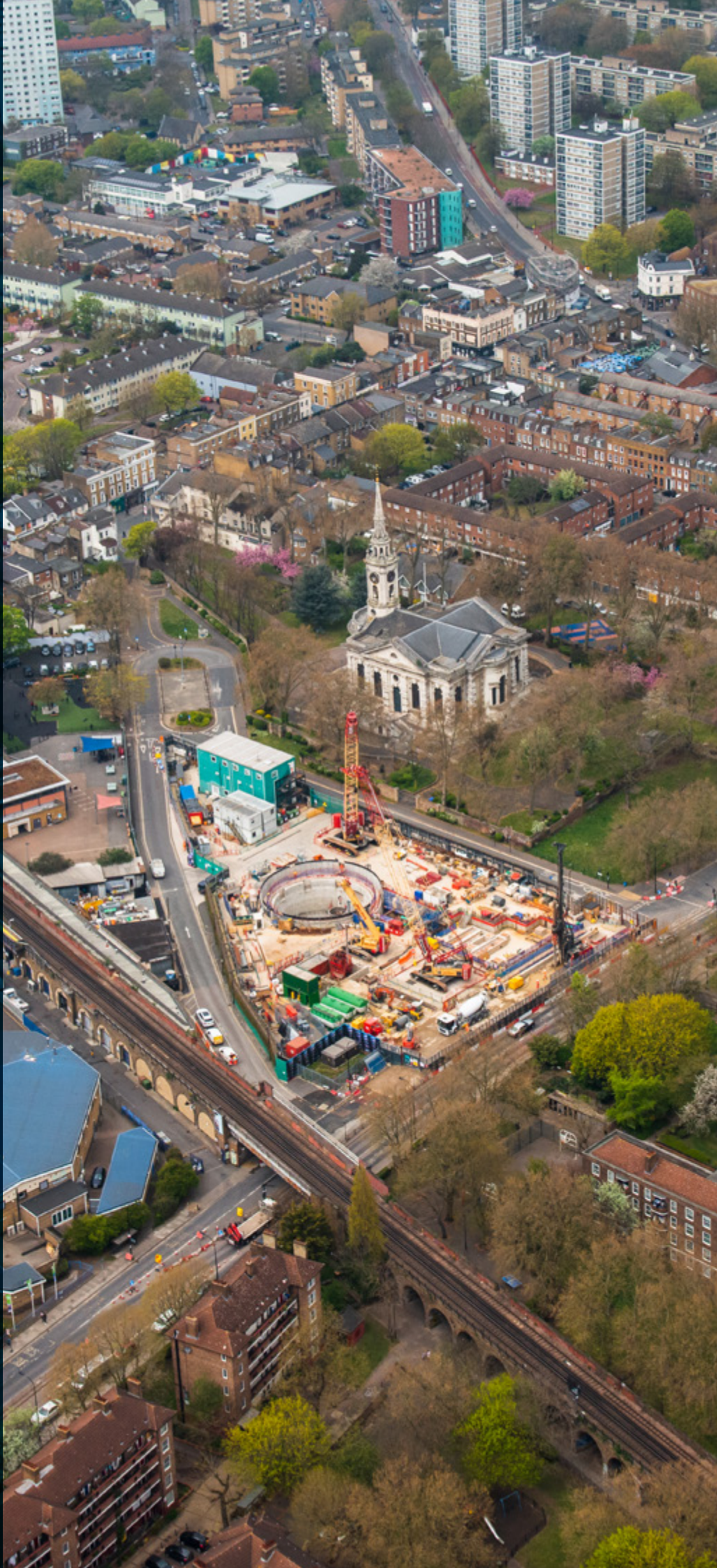
Thames Tideway Tunnel, UK