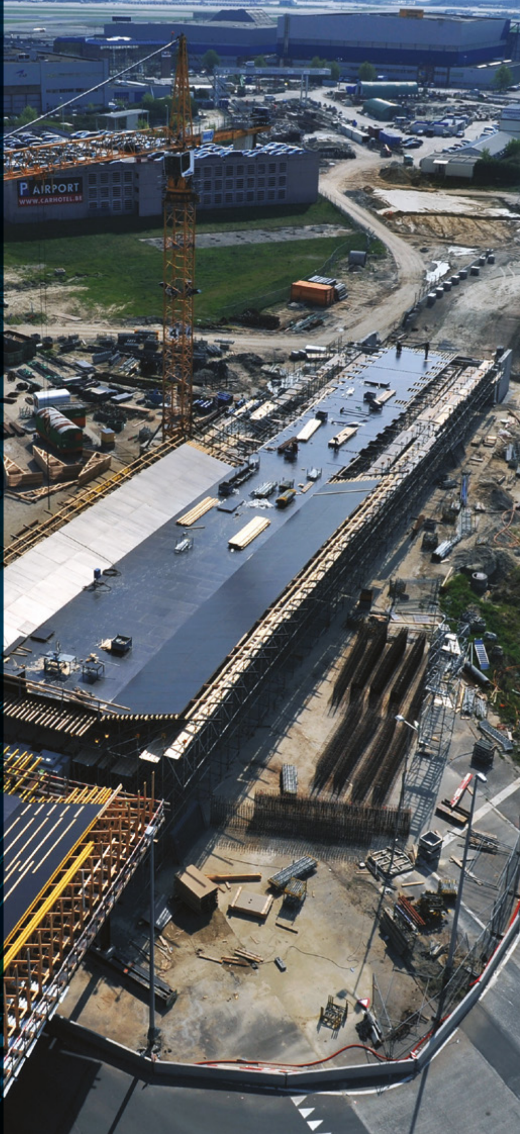
Diabolo Rail Link whilst under construction in 2009 Belgium